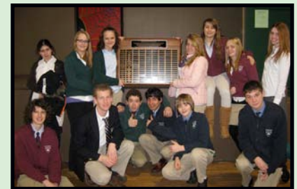
Academic Effort Recipients