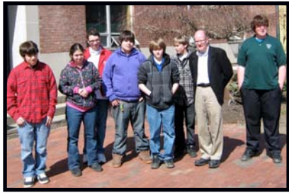
Eighth Grade Literature in Troy, NY

Montagues vs. Capulets. Sunnis vs. Shiites. "From ancient grudge break to new mutiny ..."